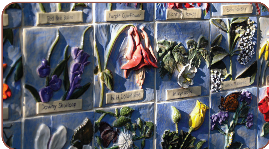
The mural is returning to Gardenside Park.

The Gardenside Neighborhood Association is looking for people to serve on the Association's board. The GNA board is a great way to get involved in the neighborhood and help keep us all connected. For the Gardenside Neighborhood Association to fulfill its mission, we need people to step forward to serve on the board. The board meets every other month for about 90 minutes, usually on Zoom, so it's not a huge time commitment and more than worth it. If you think you might be interested in serving a two year term on the Board, please send an e-mail with your name and contact information to gardensidelex@gmail.com , and we will contact you to answer your questions and talk about the next steps.